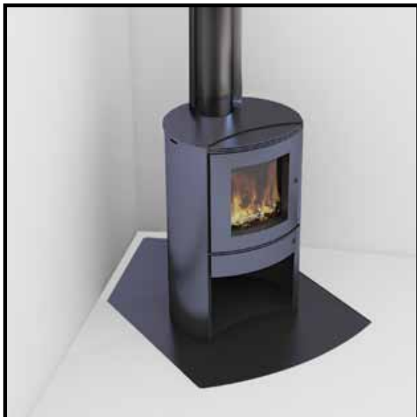
Black Steel Corner Ash Hearth