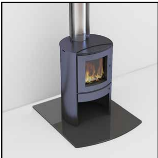
Smoked Glass Wall Ash Hearth